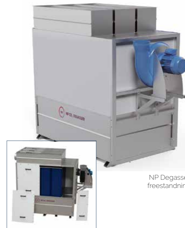
NP Degasser freestanding.