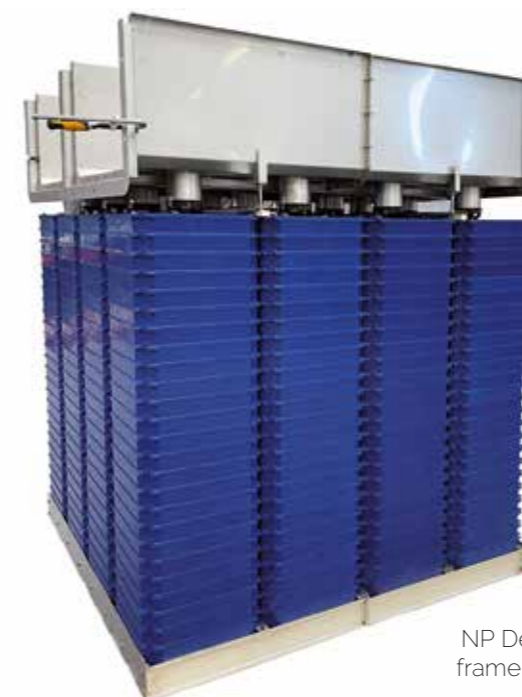
NP Degasser frame version.

Our program also contains frame version degassers without base tank, that are designed for installation in concrete chambers. These are normally used for centralized degassing systems used in RAS. One or several fans are used to extract and ventilate CO 2 from beneath the degasser.