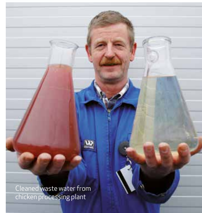
Cleaned waste water from chicken processing plant